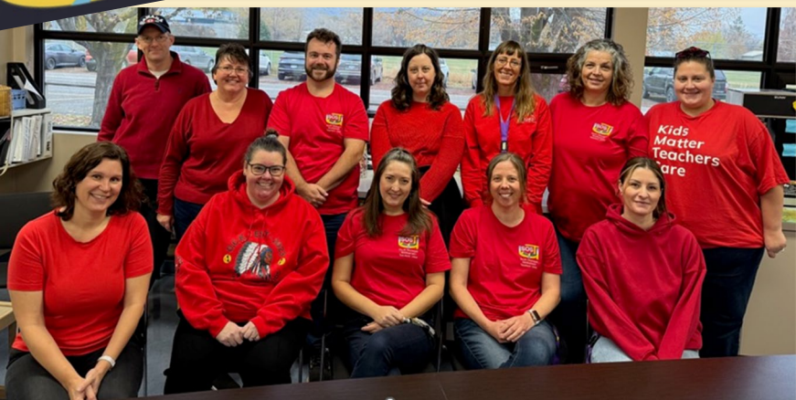
Cawston Primary School

The "Red for Ed" campaign is a grassroots movement where educators wear red to show solidarity & advocate for issues like better funding for public education, smaller class sizes, and more support for students.